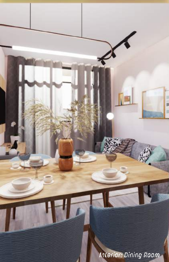
Interior: Dining Room