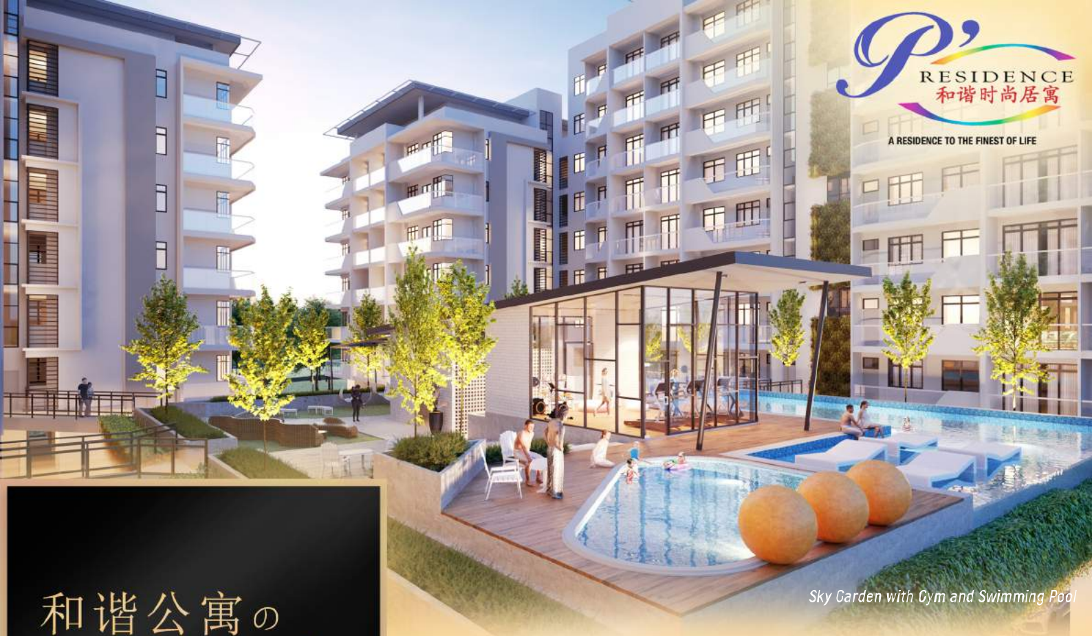
Sky Garden with Gym and Swimming Pool